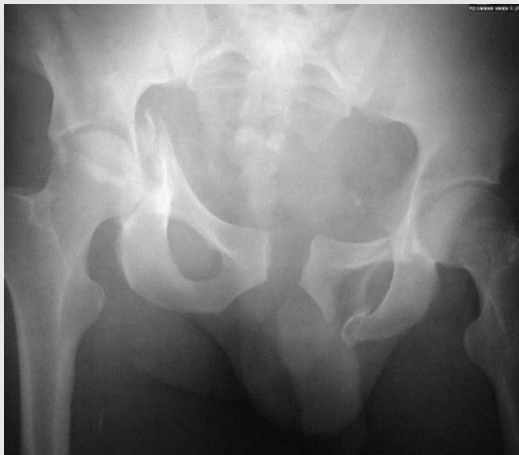
Figure 1: Correct application of a pelvic binder can achieve excellent reduction and increase intra-pelvic pressure, helping to control potentially catastrophic venous bleeding.

As confidence in the range of operative techniques to stabilise pelvic injuries increases, so the indications for these to be used seems to broaden. The role of operative stabilisation in lateral compression fractures and