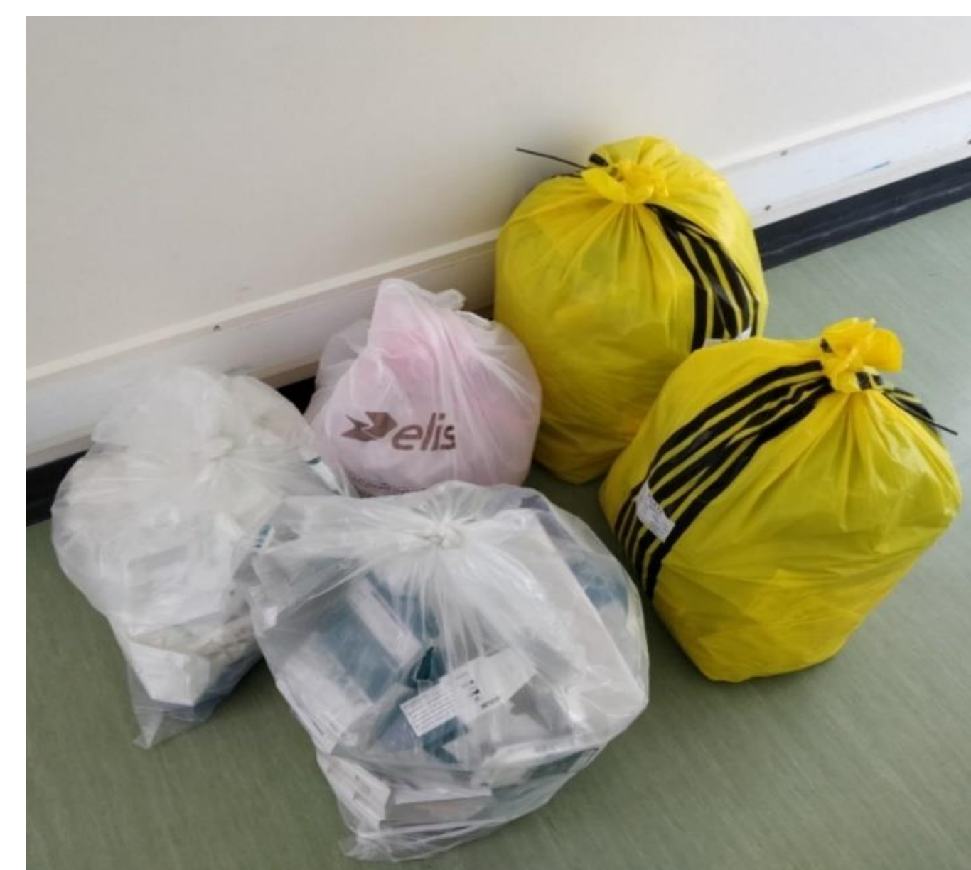
Figure 2. Waste produced by one PHO