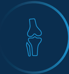
Trauma & Orthopaedics