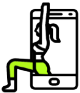
Digital Physical Therapy