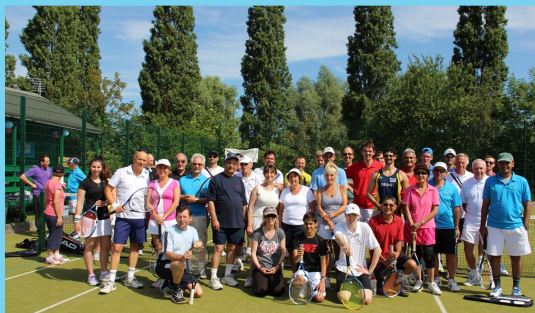
Charity Tennis Tournament

You or a loved one may suffer from a musculoskeletal disorder, been involved in major limb trauma, or had a joint replacement surgery in the past. We know that the pain can be extremely debilitating. By organising a fundraising event or taking part in a sponsored event, you are helping to find new, innovative ways of improving current methods of rehabilitation. Together we can make a difference to Trauma and Orthopaedic Research.