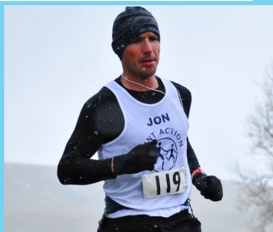
Yorkshire Three Peaks Race