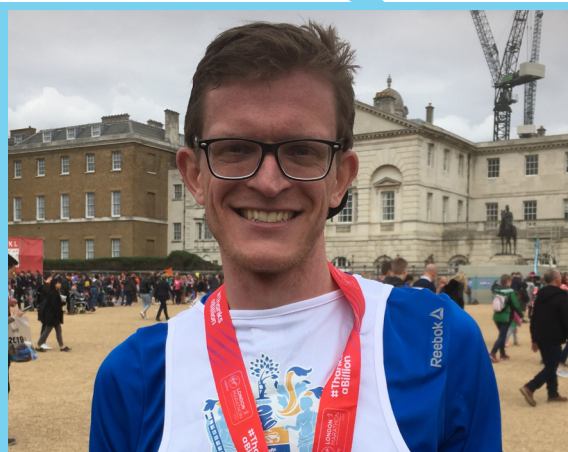
Virgin Money London Marathon

We also raise funds to support the development of clinical trials in trauma and orthopaedics. In 2019 we awarded funding for the appointment of three Surgical Specialty Leads to facilitate clinical trials in our specialty and in early 2021 we will be announcing new funding for two clinical trial units.