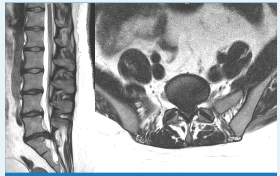
Figure 2: Sagittal and axial MRI T2 weighted images showing a large L5/S1 central disc prolapse causing compression of the cauda

The usefulness of particular symptoms and signs: