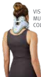
VISTA MULTIPOST COLLAR